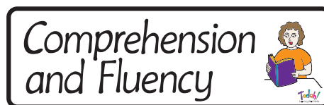
Comprehension and Fluency using the small font size.