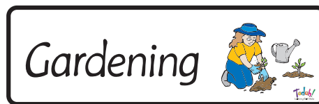
Gardening using the medium font size.