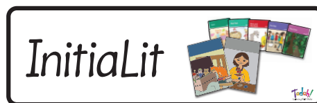
InitialLit using the large font size.

Please note: the diagram below is a guide only. New card artwork can be generated going outside the guidelines shown below, ie. the font size can be altered from the 3 mentioned below and the card can be image free when required.