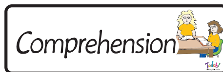
Comprehension using the small font size.