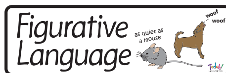
Figurative Language using the medium font size.